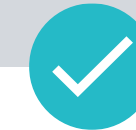
Reusable Set of four (4) clamps