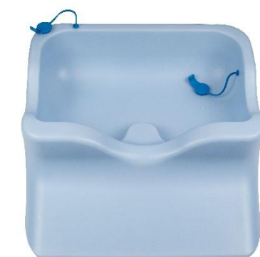
Reusable shampoo basin