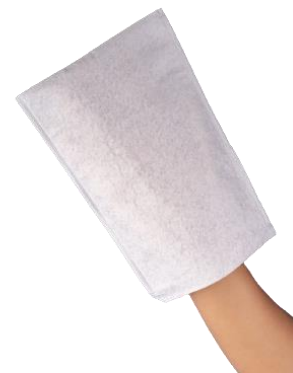
Disposable dry wash glove